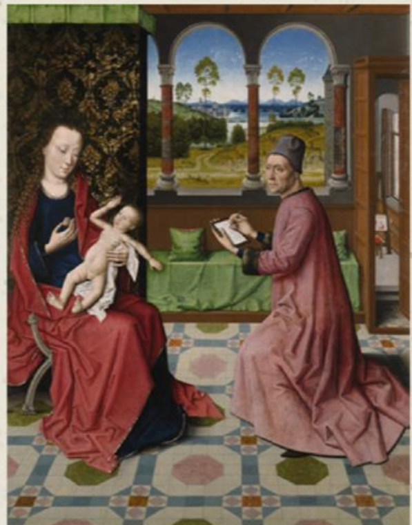
St Luke Drawing the Virgin and Child by Dieric Bouts